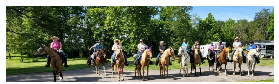
National Trail Ride - MFTHBA