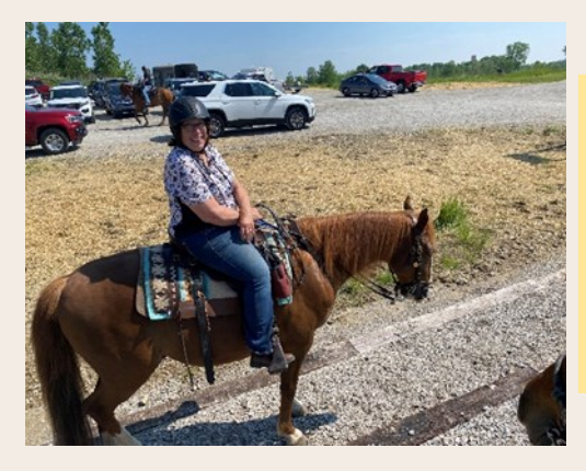
Submitted by Kathy Shafer

The parking lot is gravel and large. There is a nice staging area for mounting. There is water for the horses and a pit toilet. Donations are gladly accepted on an honor pole. It's a fun place to try you and your horse's skills.